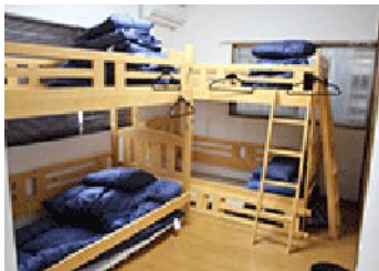
【Dorm : co-ed room】