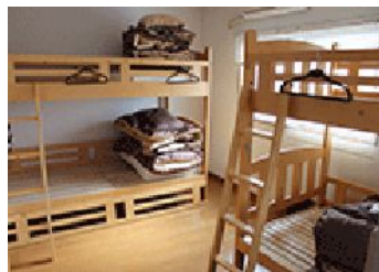
【Dorm : co-ed room】